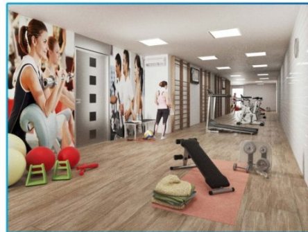
GIMNASIO / GYM