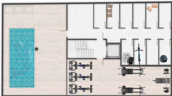
SÓTANO / BASEMENT