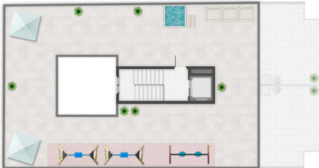
CUBIERTA / ROOFTOP