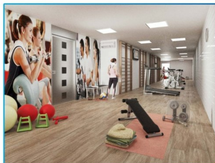
GIMNASIO / GYM