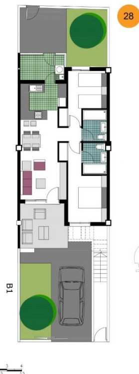
BLOQUE 2 VIVIENDA 28 PLANTA BAJA