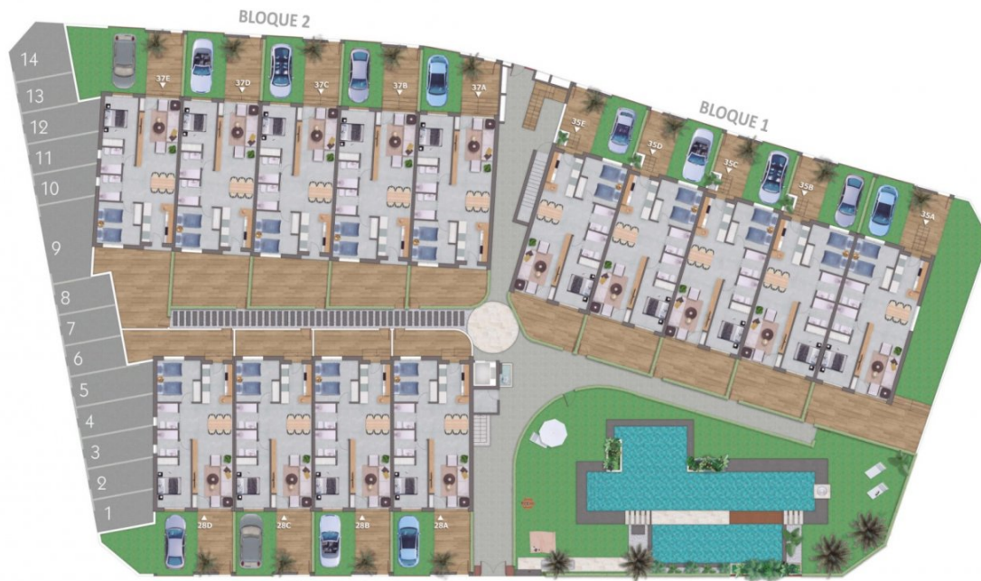
Planta Baja / Ground Floor