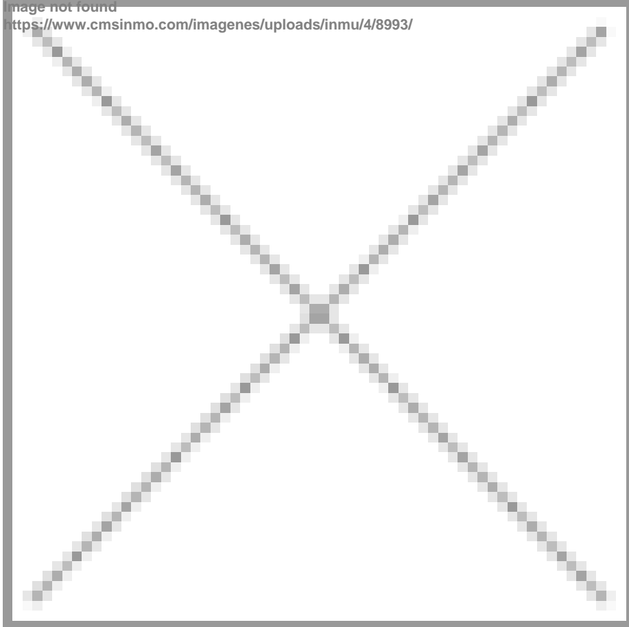
Image not found https://www.cmsinmo.com/imagenes/uploads/inmu/4/8993/