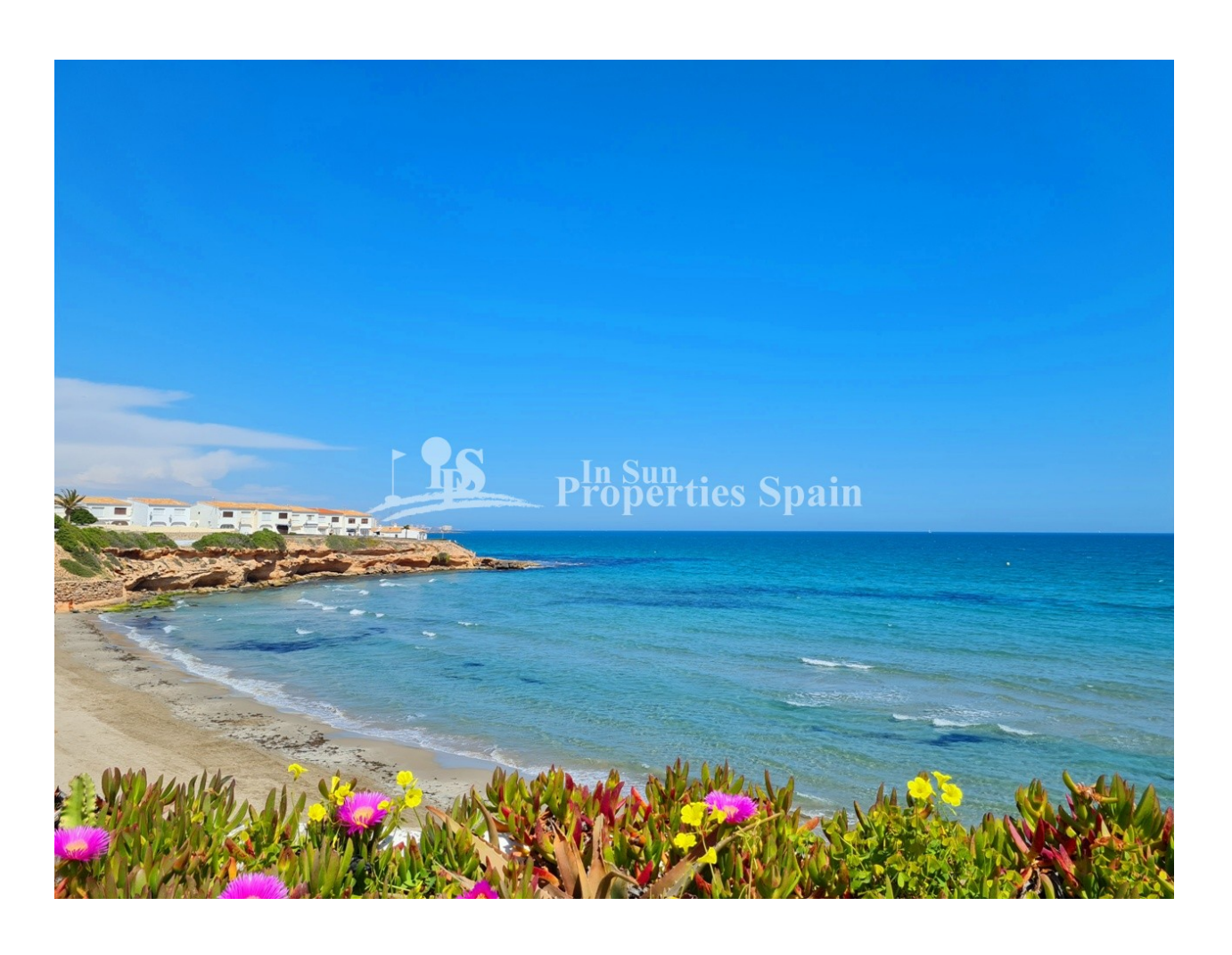
"OUR EXPERIENCE IS YOUR GUARANTEE"