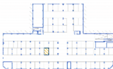
Ubicadas en Planta Garaje/Location in Parking floor