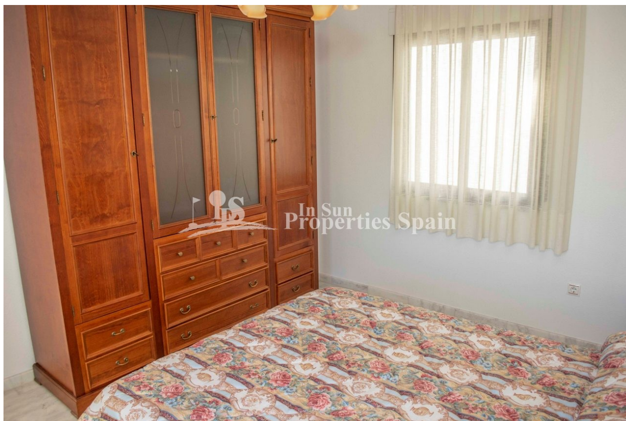
Vivienda 8 - Planta baja