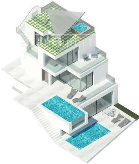
Programa Planta Cubierta Solarium : 52,33 m 2