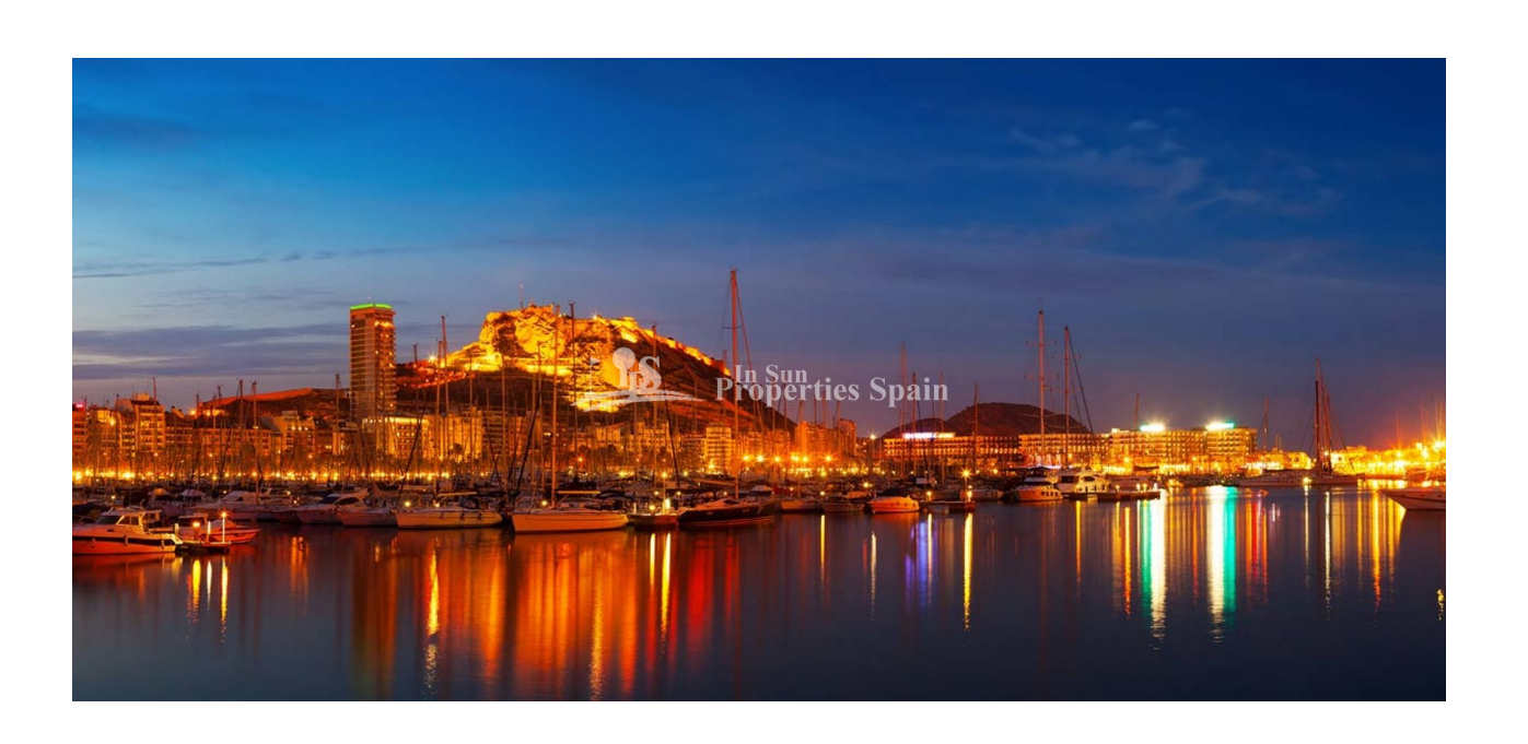
"OUR EXPERIENCE IS YOUR GUARANTEE"