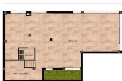
SOTANO (INCLUIDO EN VIV. 1, 21 Y 22. RESTO OPCIONAL) EL TAMAÑO DE LOS SÓTANOS PUEDE VARIAR LIGERAMENTE BAJO DECISIÓN FACULTATIVA