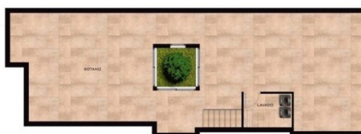
SOTANO ( INCLUIDO EN VIV. 11, 13 Y 14. RESTO OPCIONAL) EL TAMAÑO DE LOS SÓTANOS PUEDE VARIAR LIGERAMENTE BAJO DECISIÓN FACULTATIVA