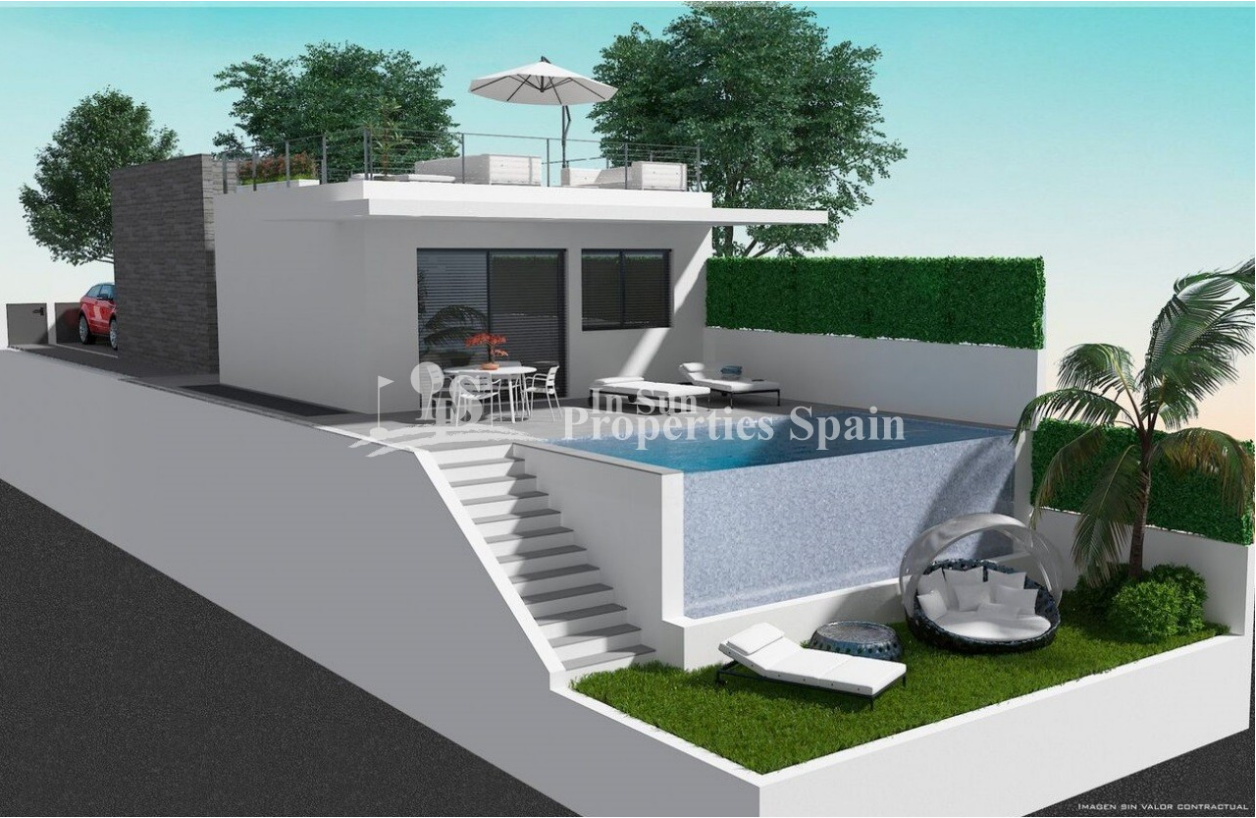
IMAGEN SIN VALOR CONTRACTUAL