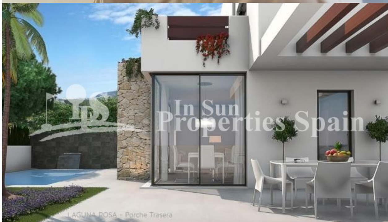
LAGUNA ROSA - Porche Trasera