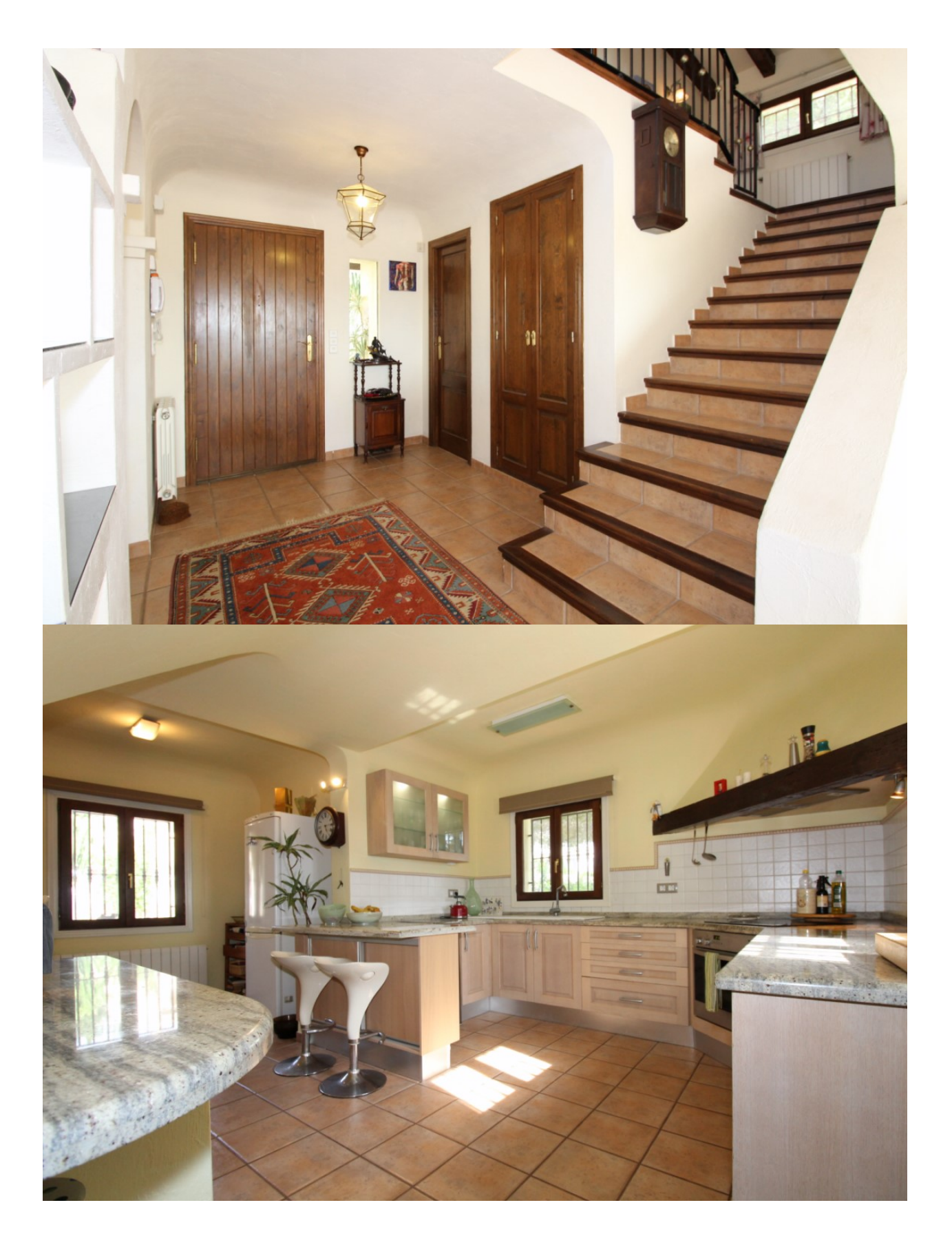
"OUR EXPERIENCE IS YOUR GUARANTEE"