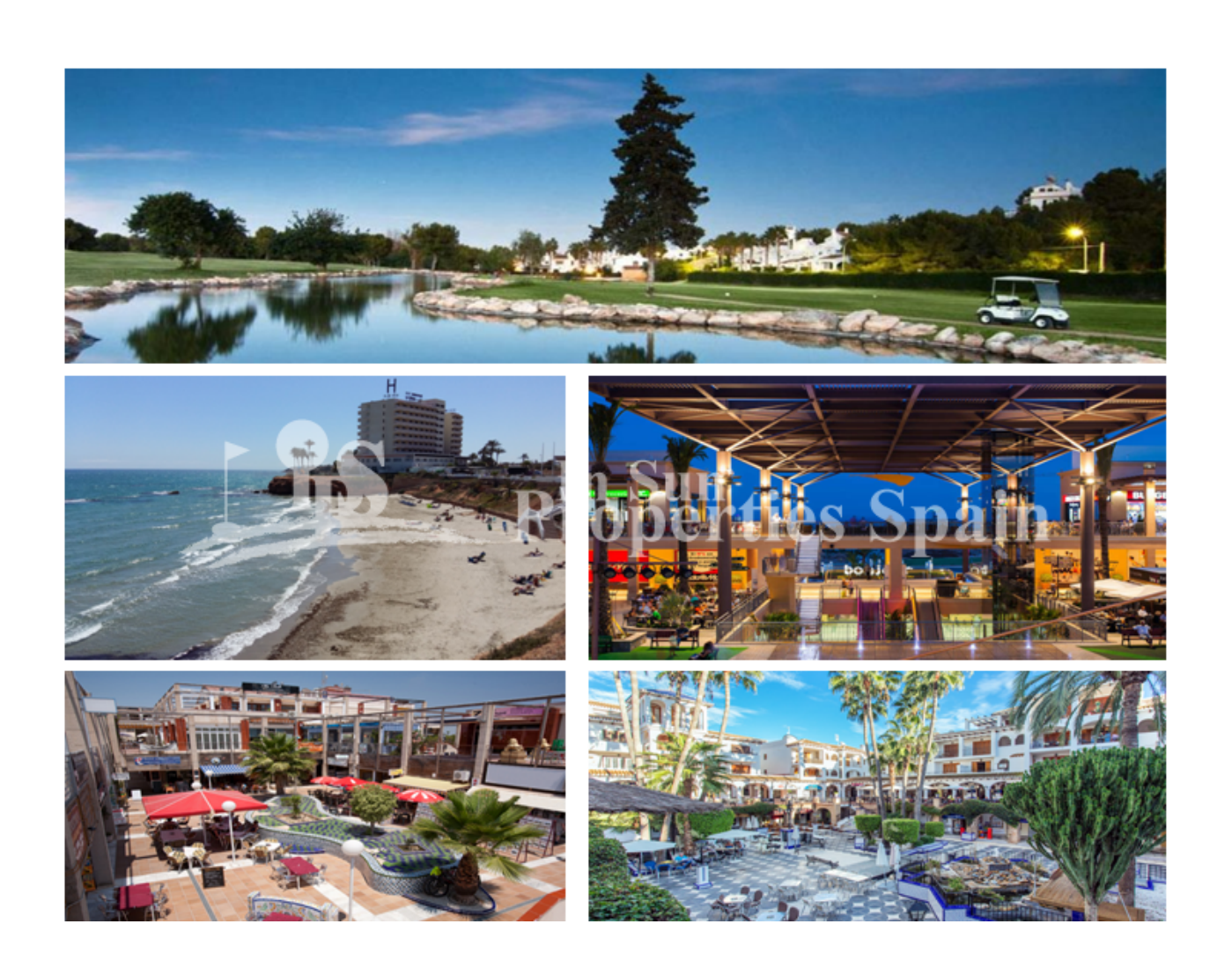
"OUR EXPERIENCE IS YOUR GUARANTEE"