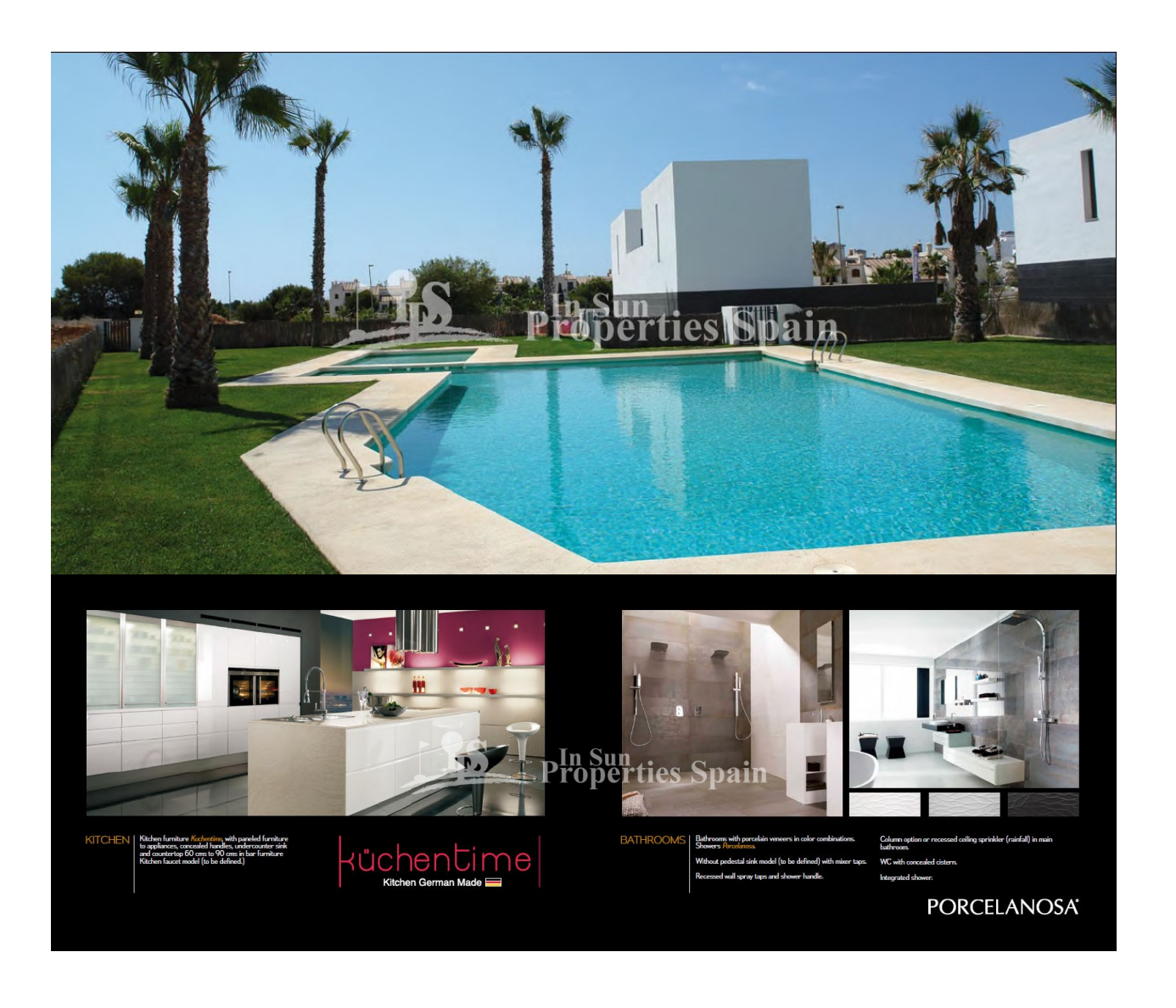
"OUR EXPERIENCE IS YOUR GUARANTEE"