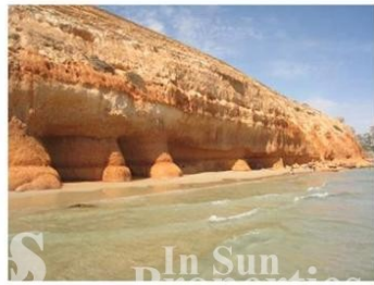
CALA JUNTO A PLAYA DE AGUAMARINA