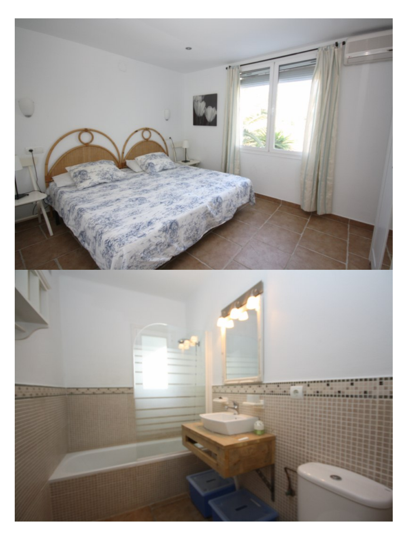
"OUR EXPERIENCE IS YOUR GUARANTEE"