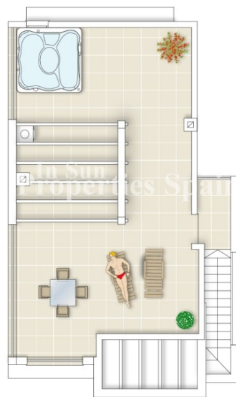
VIVIENDA 3 D - PLANTA ALTA