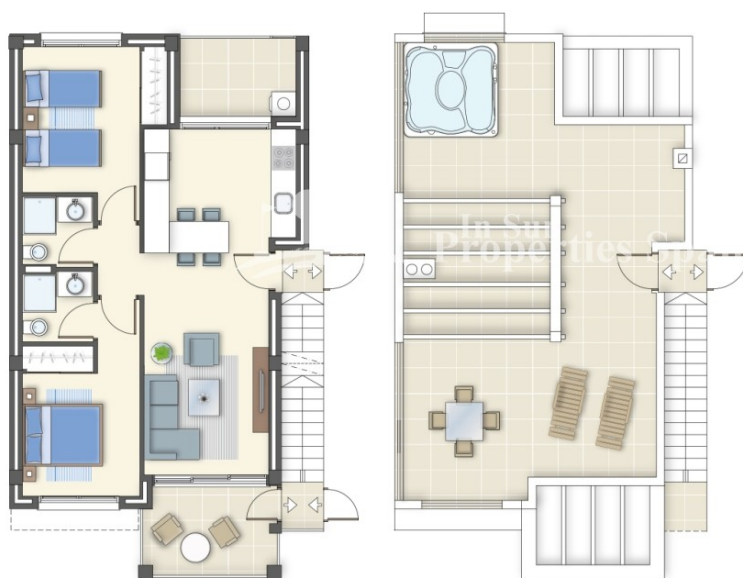
VIVIENDA 2 D - PLANTA ALTA