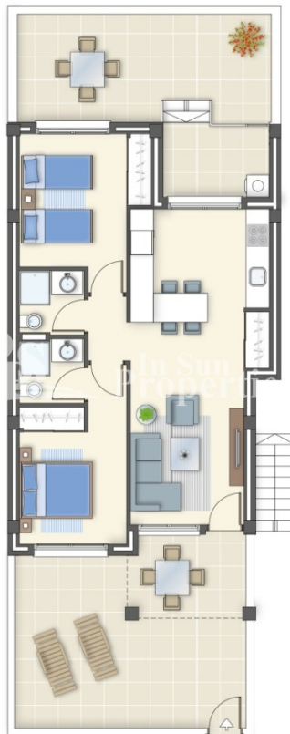
VIVIENDA 2 D - PLANTA BAJA