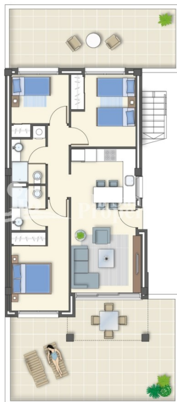
VIVIENDA 3 D - PLANTA BAJA