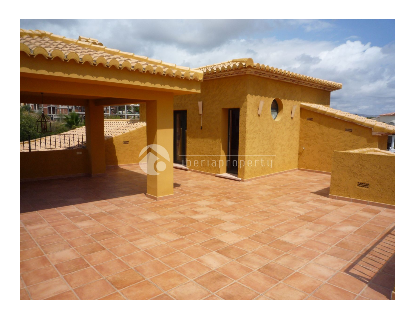
"OUR EXPERIENCE IS YOUR GUARANTEE"