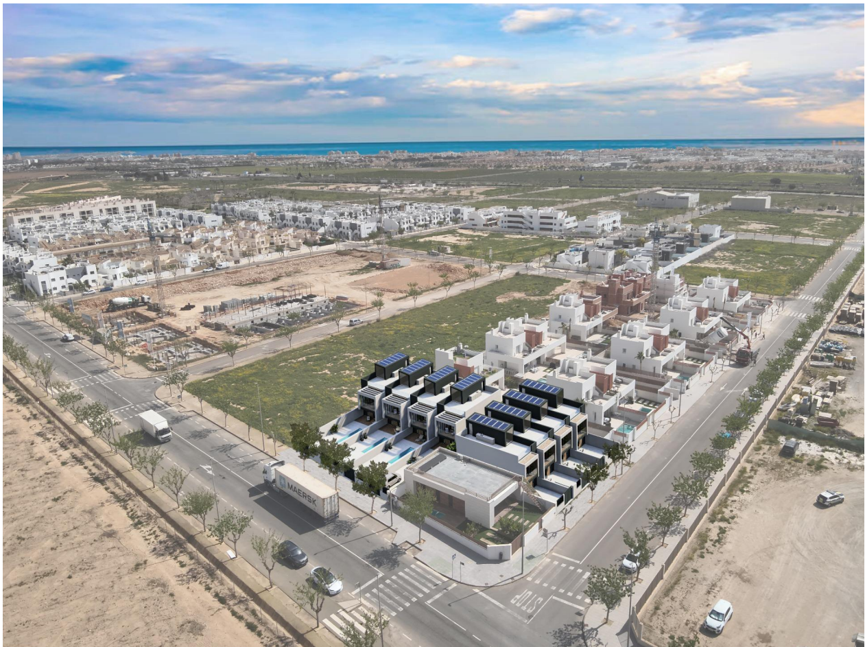
Vivienda 5, 6, 7, 8