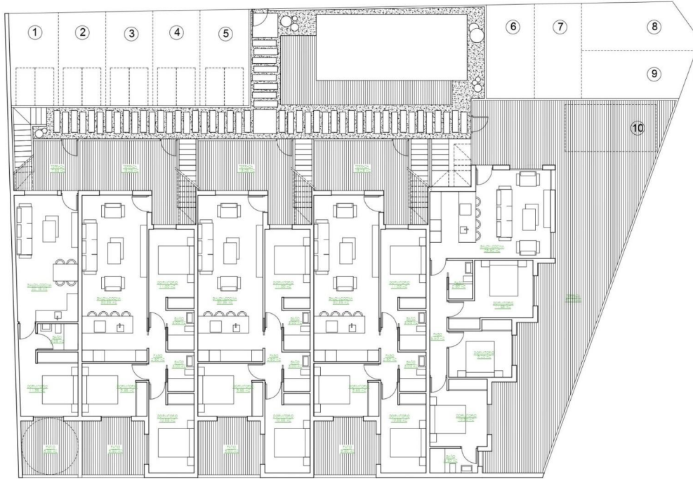
Planta Baja Conjunto