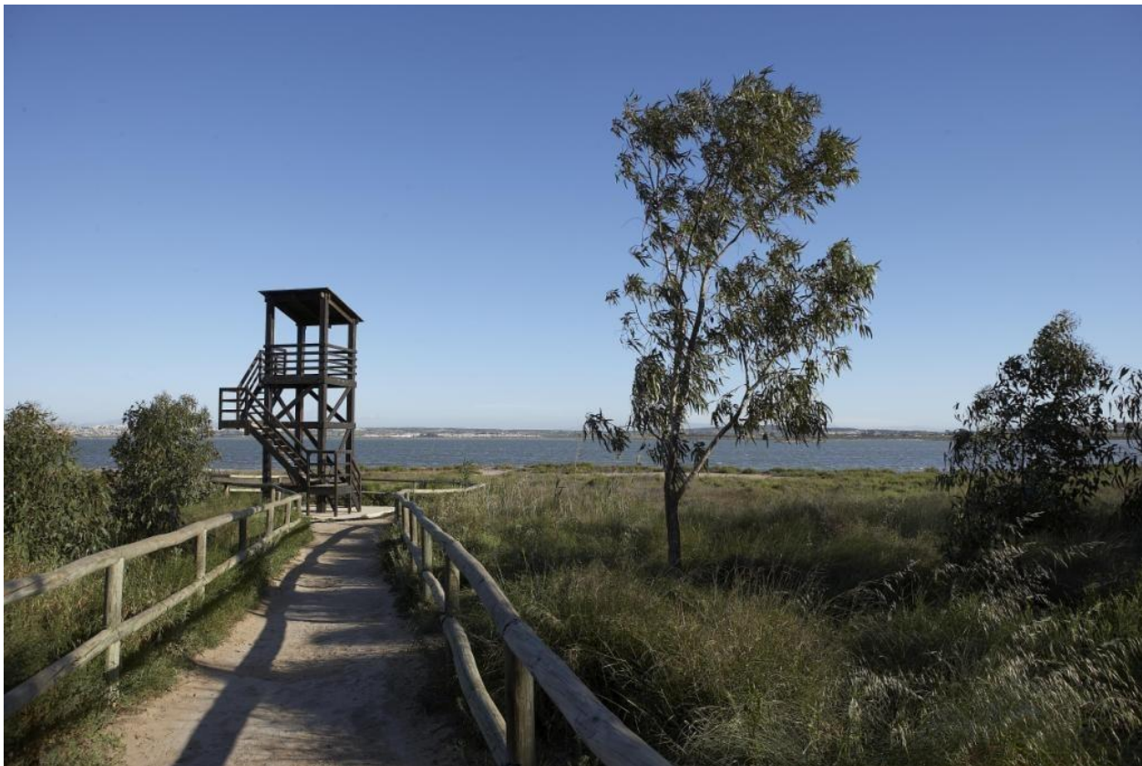
Imagen informativa sin escala / Informative image not scaled and subject to changes. Se reserva el derecho de modificaciones por motivos técnicos, jurídicos o comerciales.