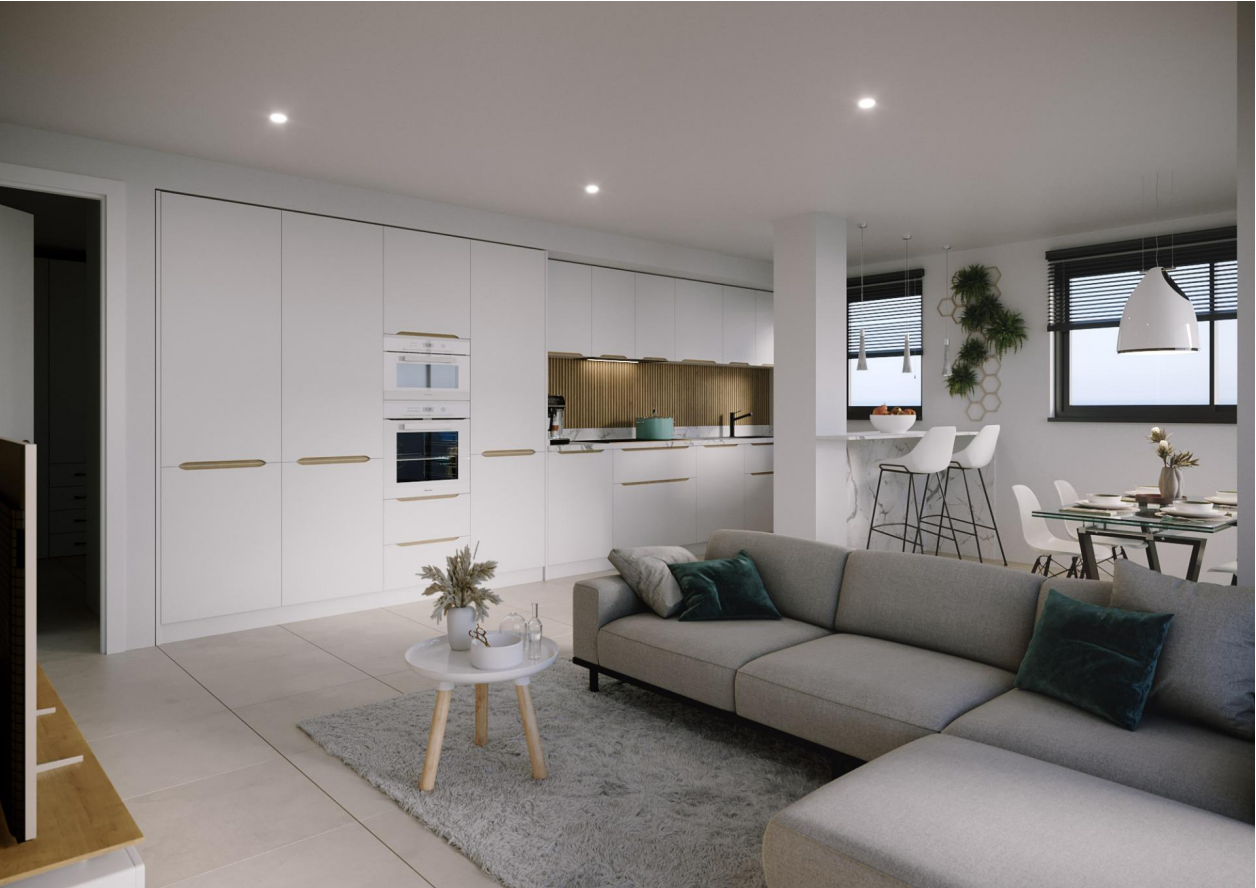
PLANTA PRIMERA / ESCALERA 3 VIVIENDA 1