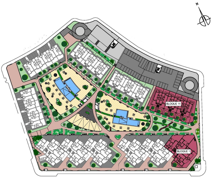
PLANTA DE CONJUNTO (FASE 1)

Este documento (tanto su parte gráfica como los datos referidos a superficies) tienen carácter meramente orientativo, sin perjuicio de la información más exacta contenida. Los datos referidos a superficies son meramente orientativos y pueden sufrir variaciones como consecuencia de exigencias comerciales, jurídicas, técnicas o de ejecución de proyecto.