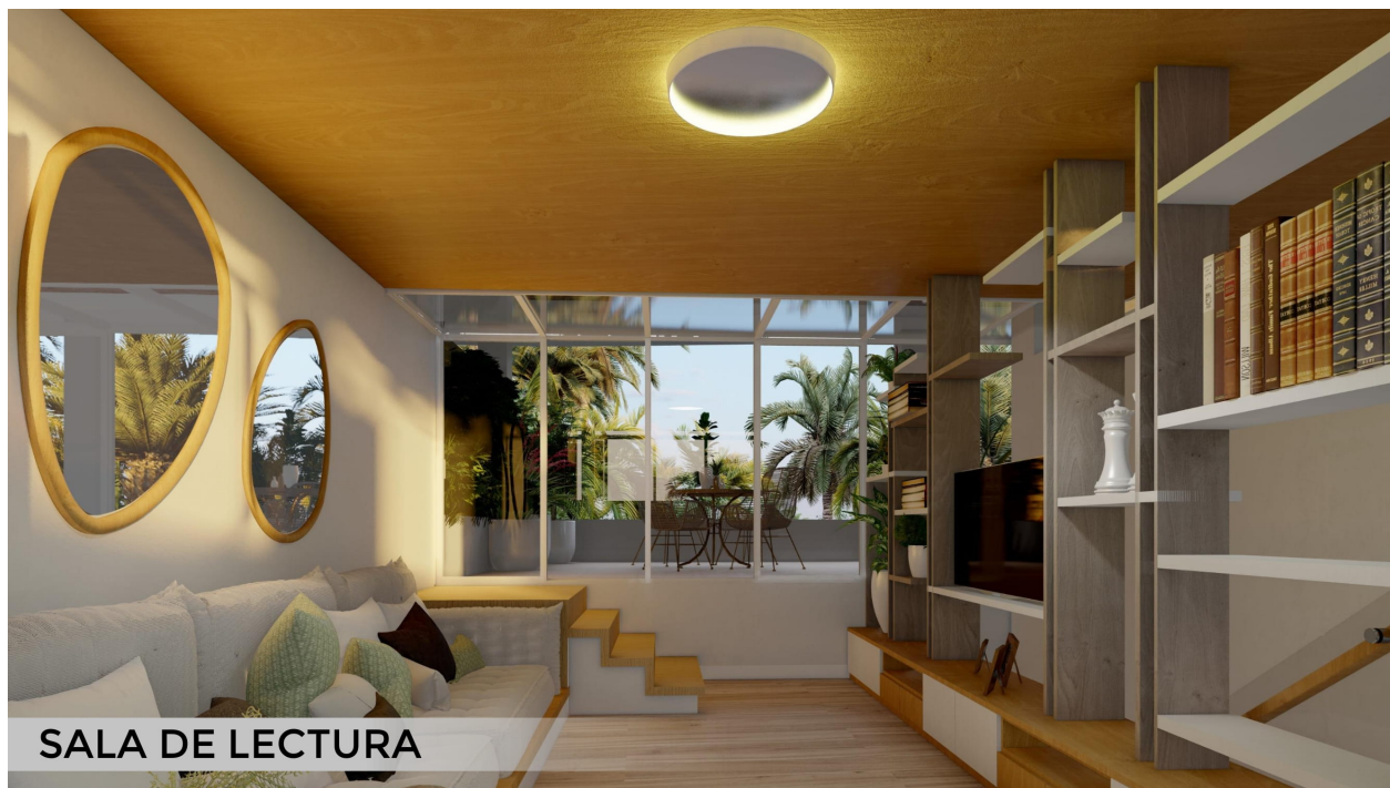
SALA DE LECTURA