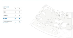
Tipología: 2 dormitorios