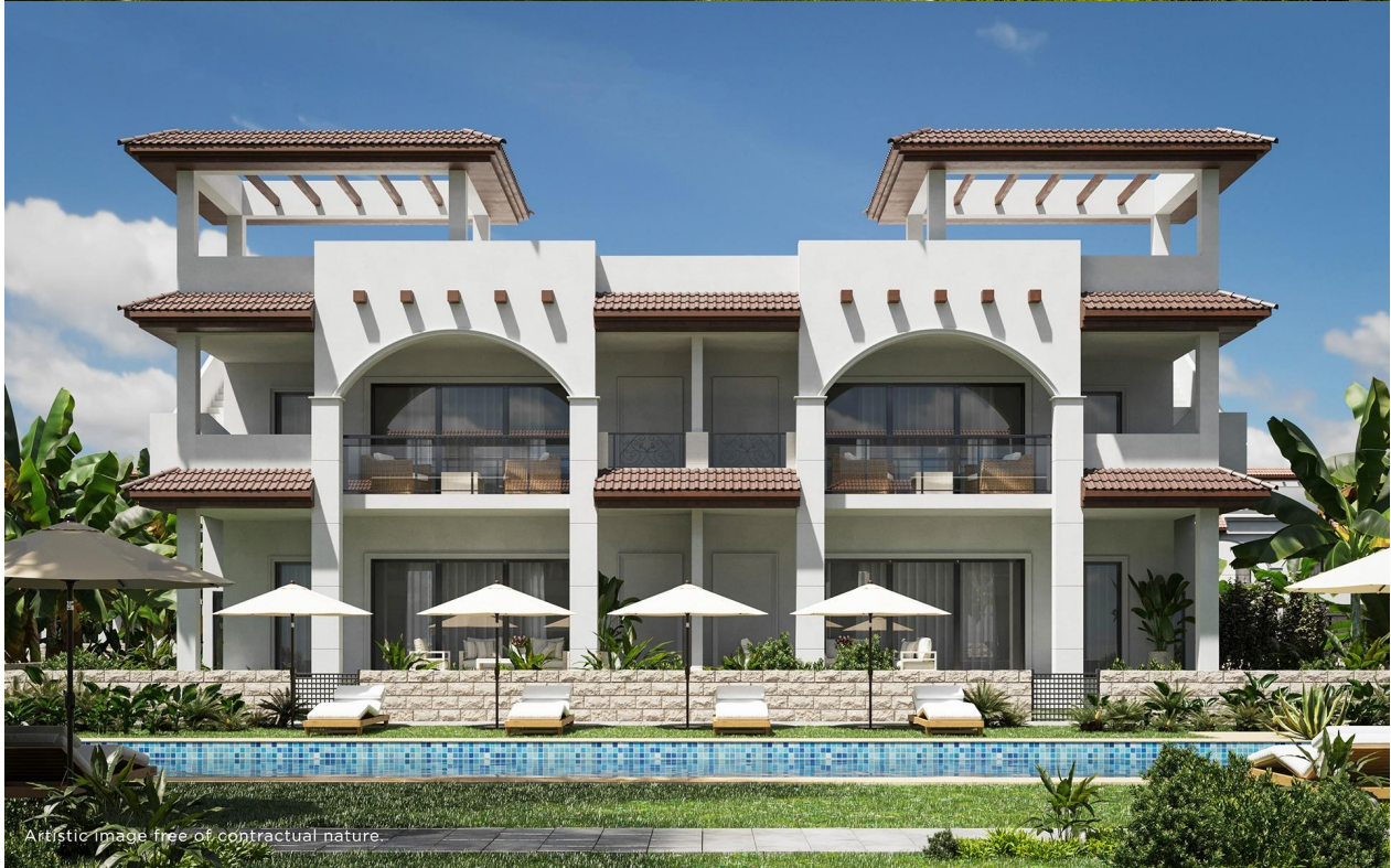
Artistic image free of contractual nature.