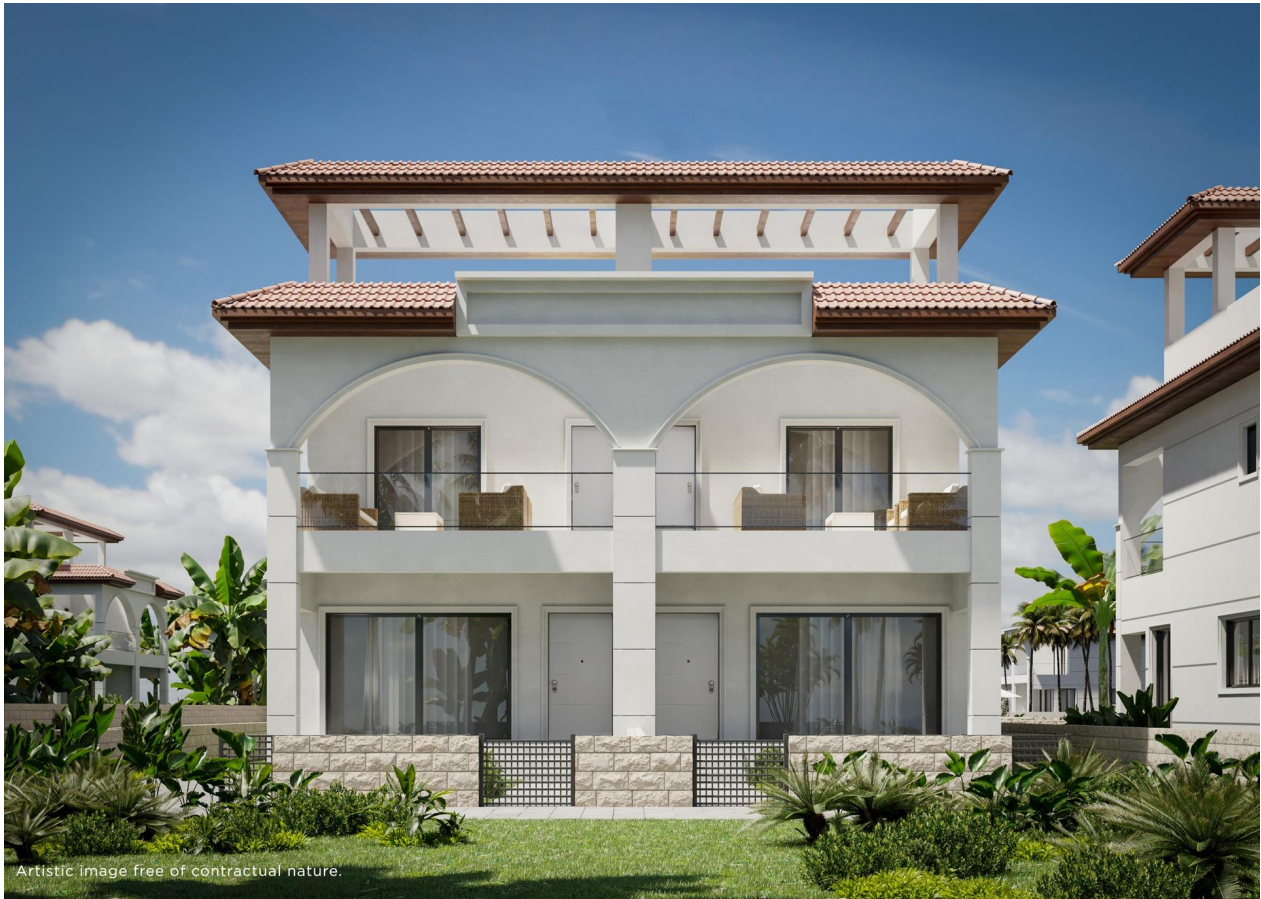
Artistic image free of contractual nature.