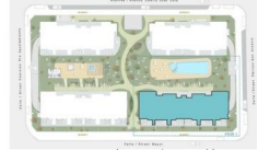
BLOQUE 1 - Planta Baja