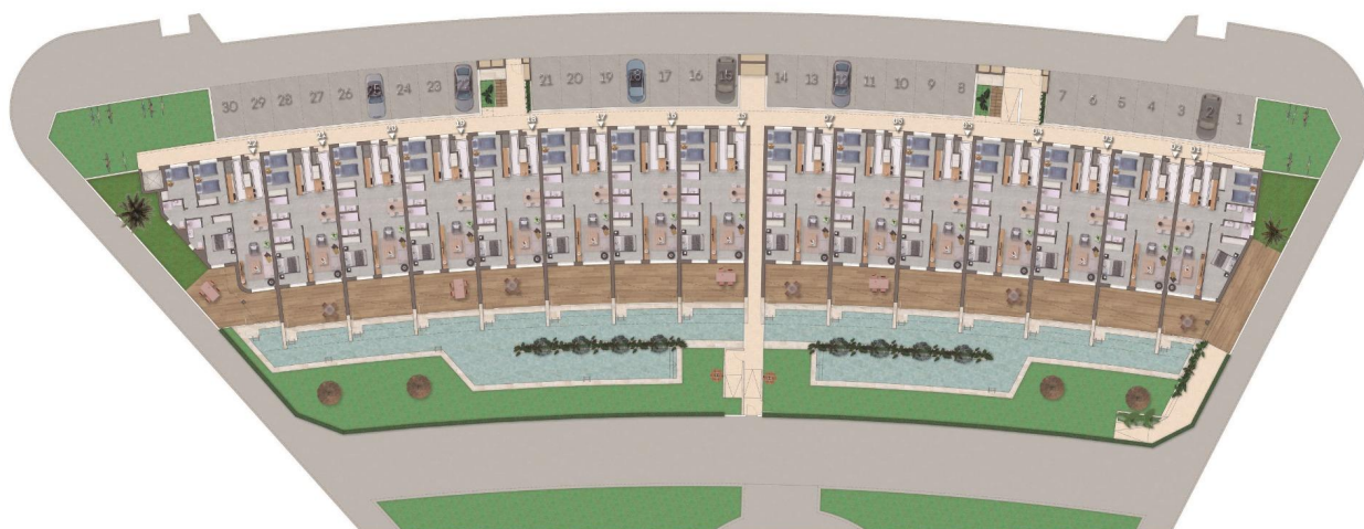
Planta Baja / Ground Floor