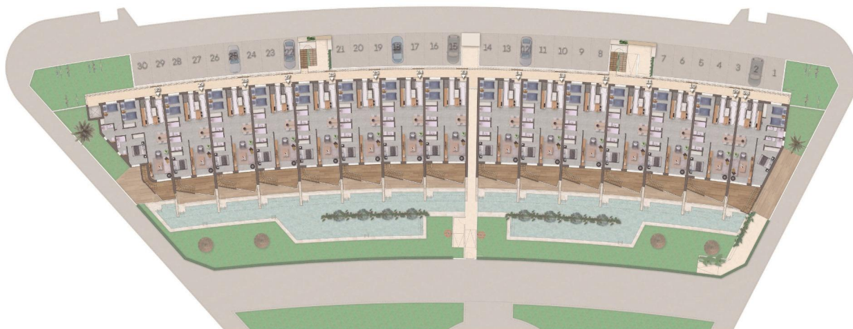
Planta Primera / First Floor