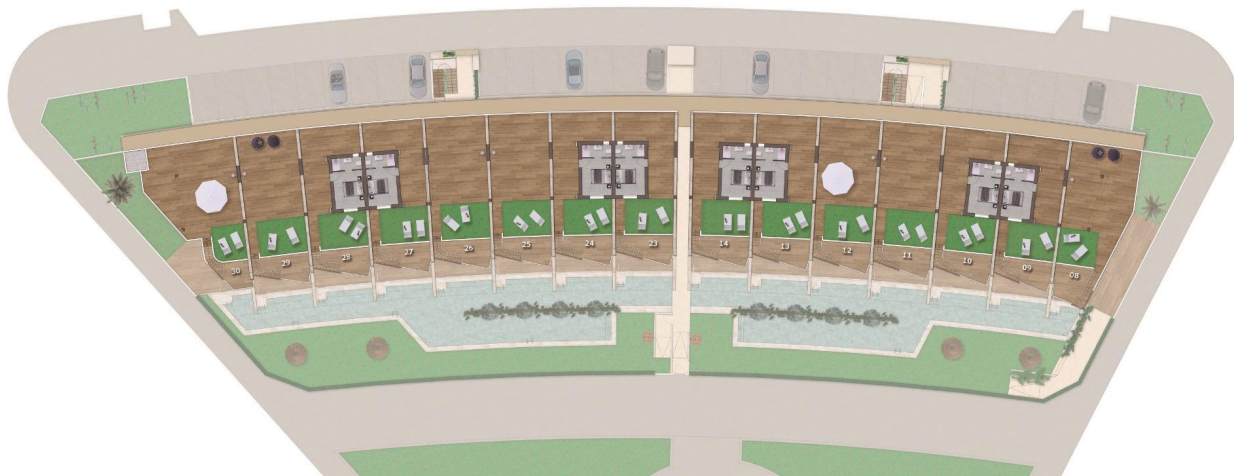
Planta Solarium/ Topfloor