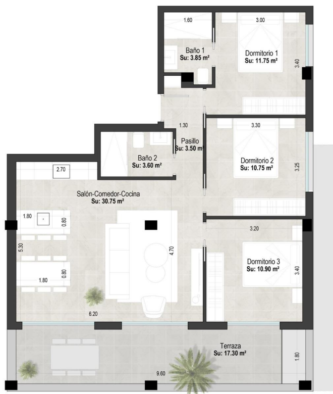
tabla de superficies