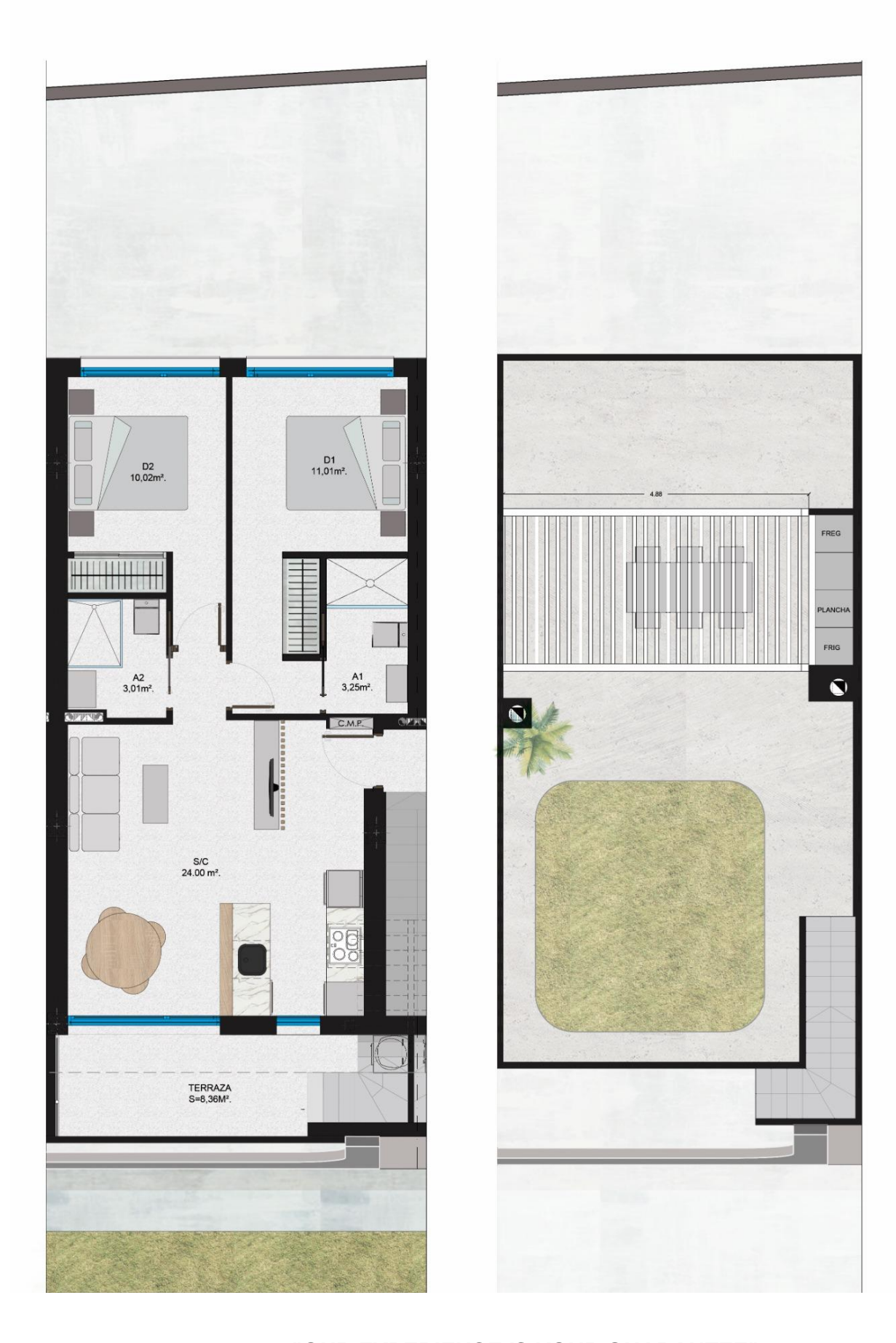
"OUR EXPERIENCE IS YOUR GUARANTEE"