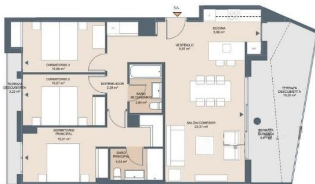
Esc. 2 P05-A