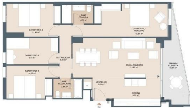
Esc. 1 P04-C