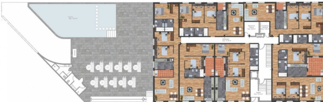
VIVIENDA PLANTA BAJA. MODELO 03