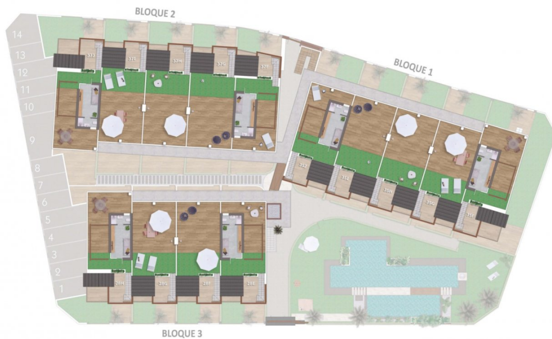
Planta Solarium / Topfloor