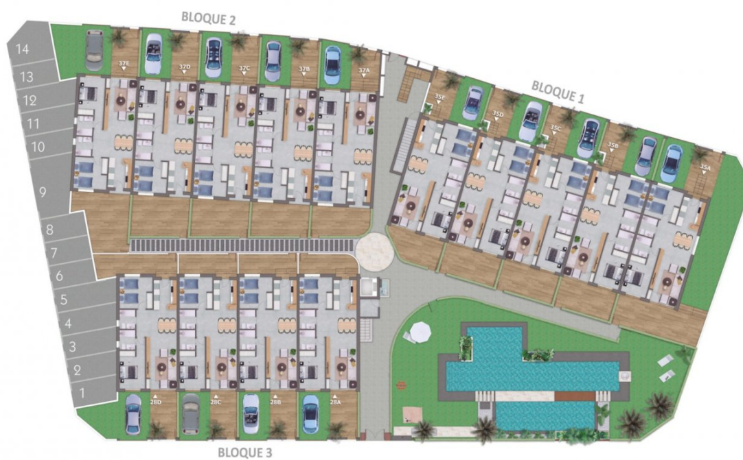
Planta Baja / Ground Floor