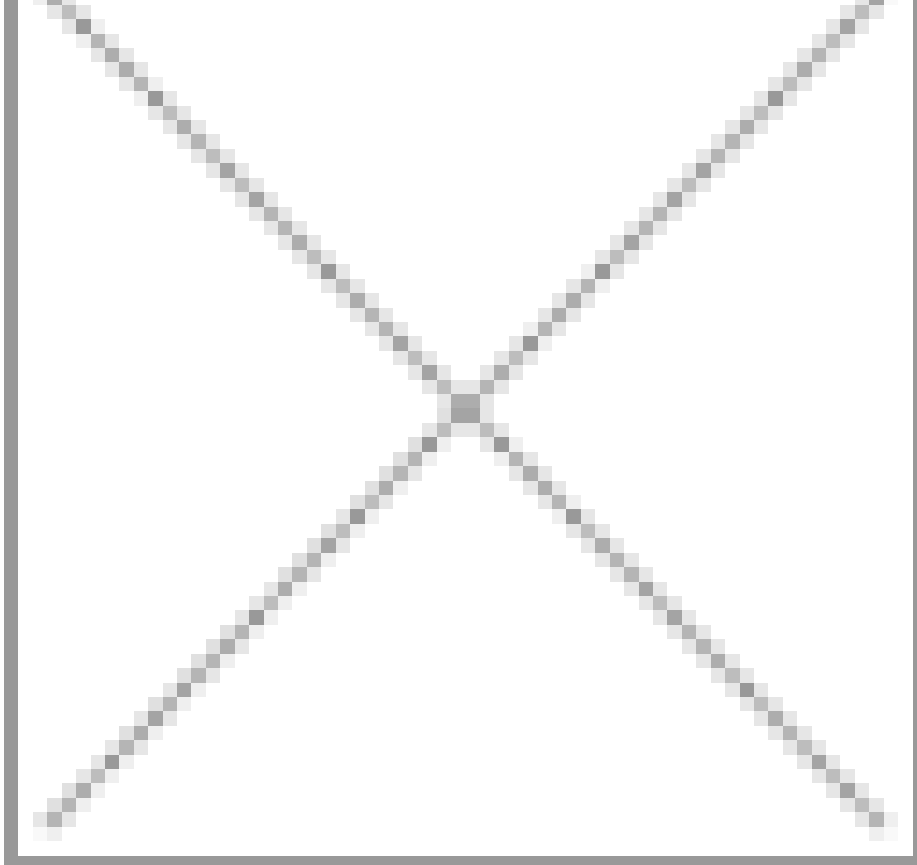
Image not found https://www.cmsinmo.com/imagenes/uploads/inmu/4/10570/