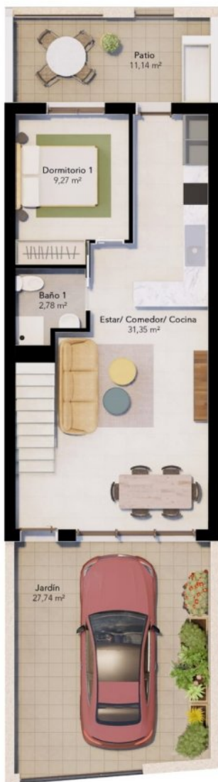
PLANTA BAJA GROUND FLOOR