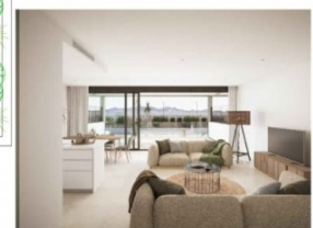
3 BEDROOMS / 3 DORMITORIOS