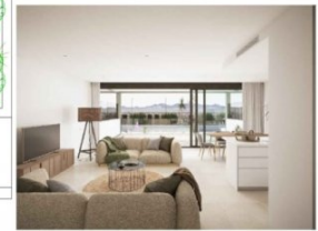
3 BEDROOMS / 3 DORMITORIOS