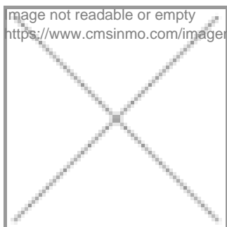
Image not readable or empty https://www.cmsinmo.com/imagenes/uploads/inmu/4/9193/img09193.jpg