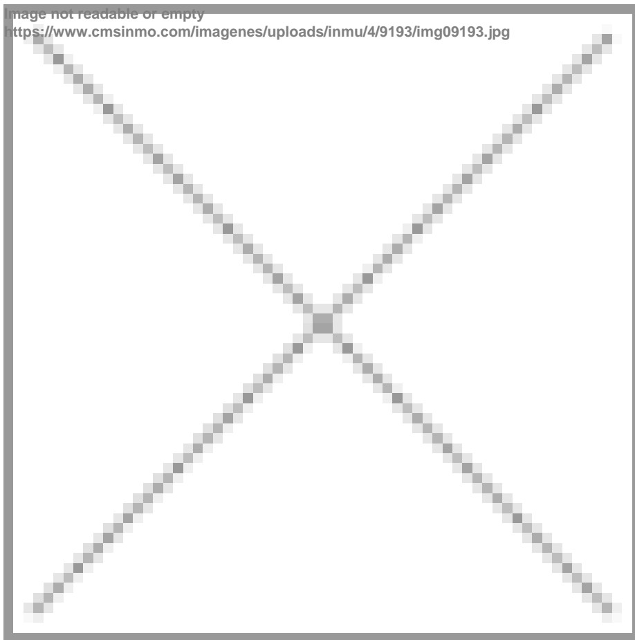
Image not readable or empty https://www.cmsinmo.com/imagenes/uploads/inmu/4/9193/img09193.jpg