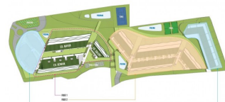
TIPOLÓGICAS APARTAMENTOS 1 DORMITORIO