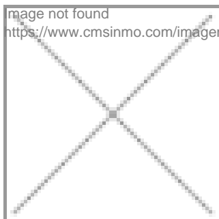
image not found https://www.cmsinmo.com/imagenes/uploads/inmu/4/6218/http://orangevillas.com/media/images/p