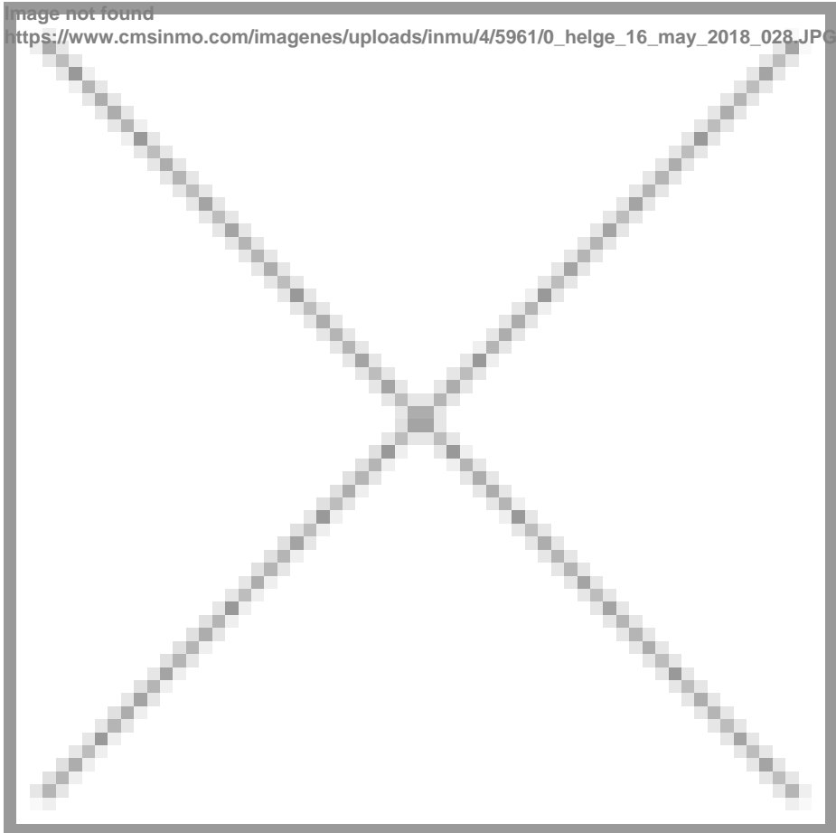
image not found https://www.cmsinmo.com/imagenes/uploads/inmu/4/5961/0_helge_16_may_2018_028.JPG