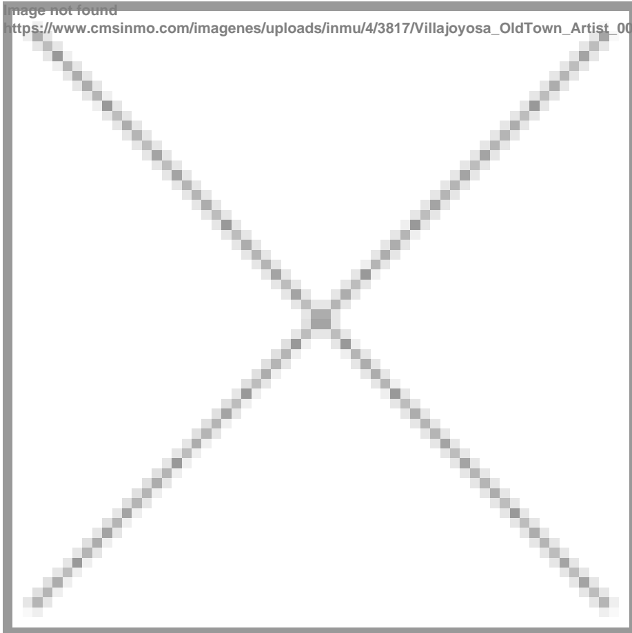
image not found https://www.cmsinmo.com/imagenes/uploads/inmu/4/3817/Villajoyosa_OldTown_Artist_00.JPG