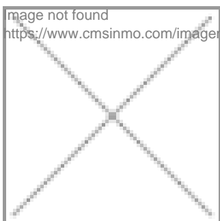
image not found https://www.cmsinmo.com/imagenes/uploads/inmu/4/3817/Villajoyosa_OldTown_Artist_00.JPG