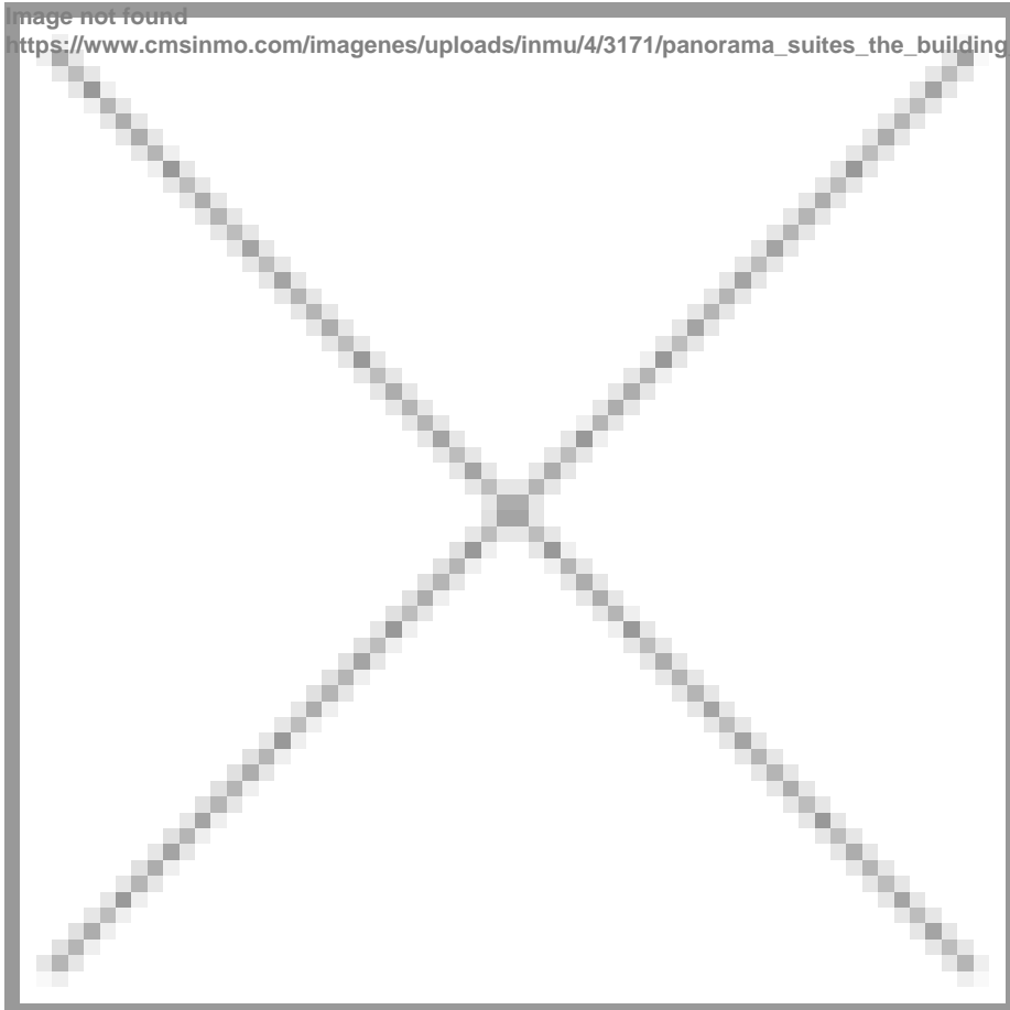
image not found https://www.cmsinmo.com/imagenes/uploads/inmu/4/3171/panorama_suites_the_building_5014[1]