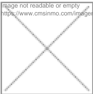
Image not readable or empty https://www.cmsinmo.com/imagenes/uploads/inmu/4/12420/img012420.jpg