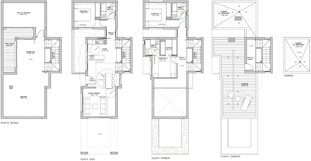
CUADRO DE SUPERFICIES