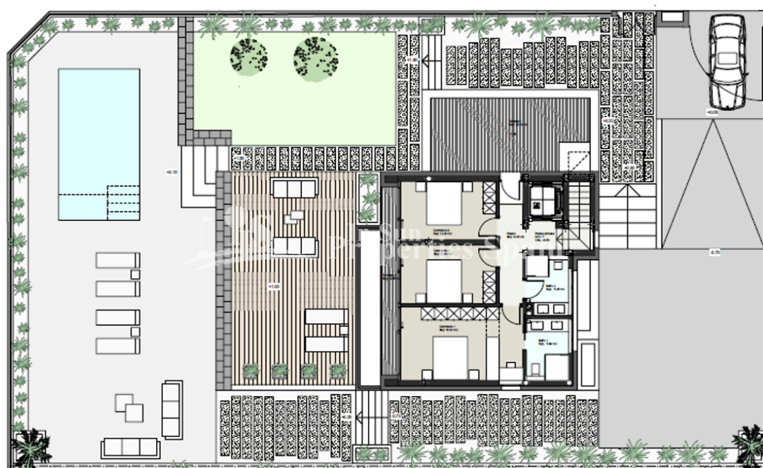
VIVIENDA N°1. Planta primera