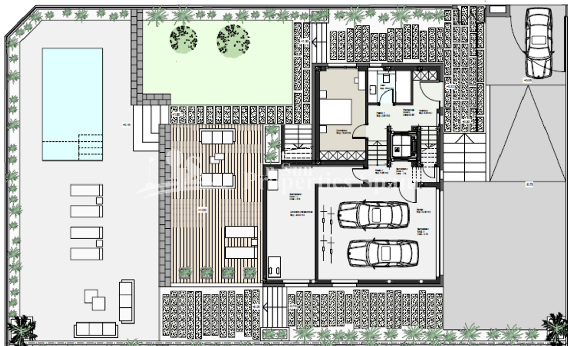
VIVIENDA N°1. Planta semisótano