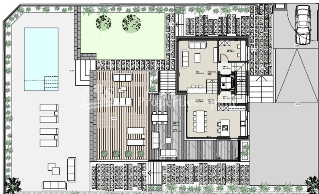
VIVIENDA N°1. Planta baja