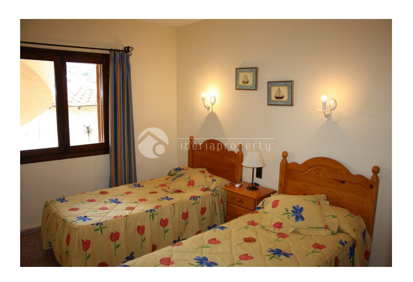
"OUR EXPERIENCE IS YOUR GUARANTEE"