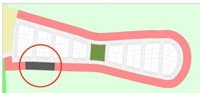
VIVIENDA 1 VILLAS ALBA MAR MENOR GOLF RESORT