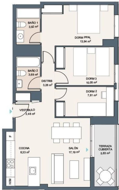
Portal 2, P2-D