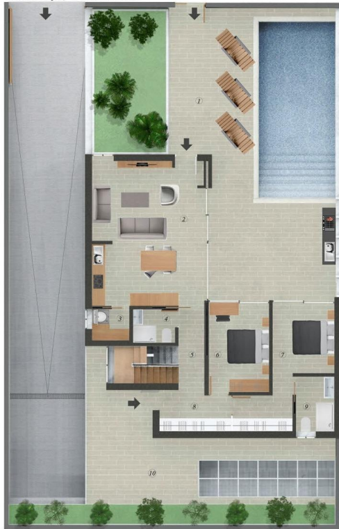
Planta Baja / Ground Floor